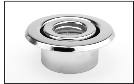
STYLE 60 TWO-PIECE ESCUTCHEON

Step 4. Using appropriate sprinkler wrench, apply wrench to designated sprinkler wrenching area and tighten sprinkler into sprinkler fitting. (Refer to Technical Data Sheet TFP220).